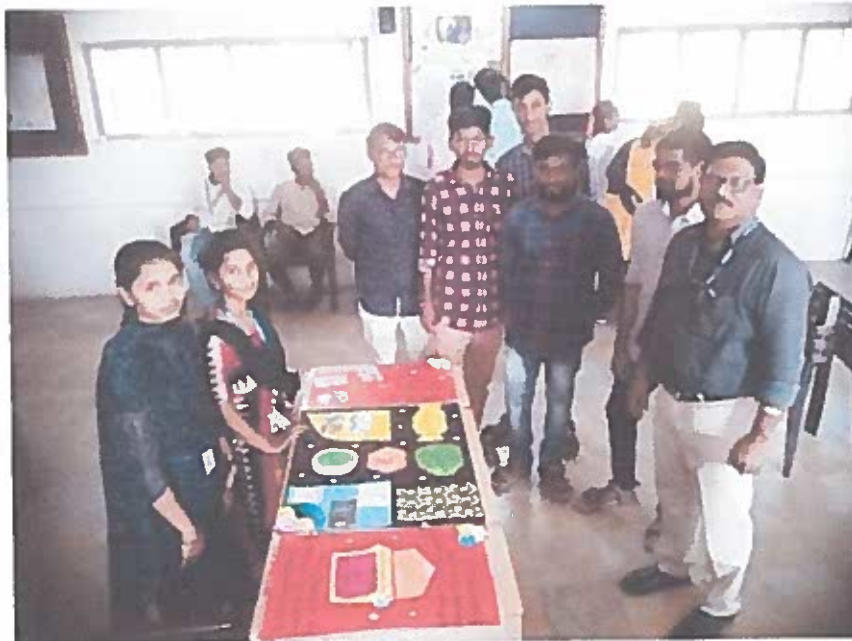
Poster Presentation by students during National Science Day conducted on 28th February 2023.