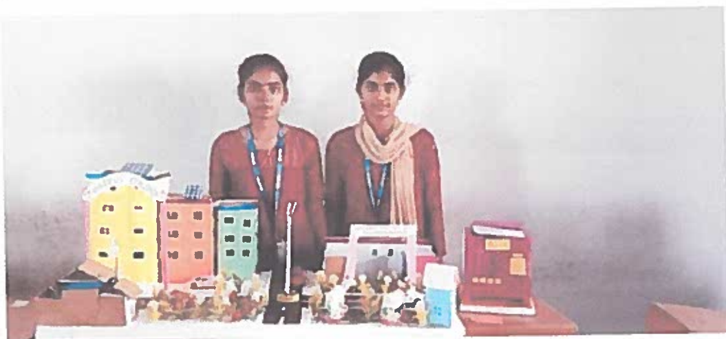
Students presenting Hand Made Crafts on the eve of National Science Day on 28th February 2023 as a part of IIC activity.