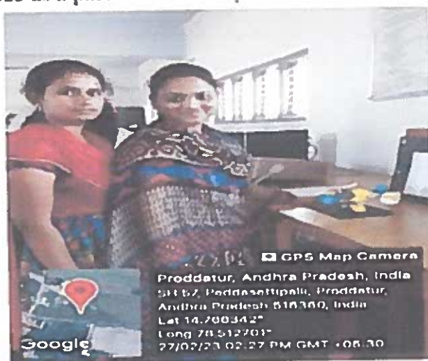
Students displaying their designed scientific modal during Science Exhibition conducted on the eve of Ntaional Science Day on 28th February 2023.