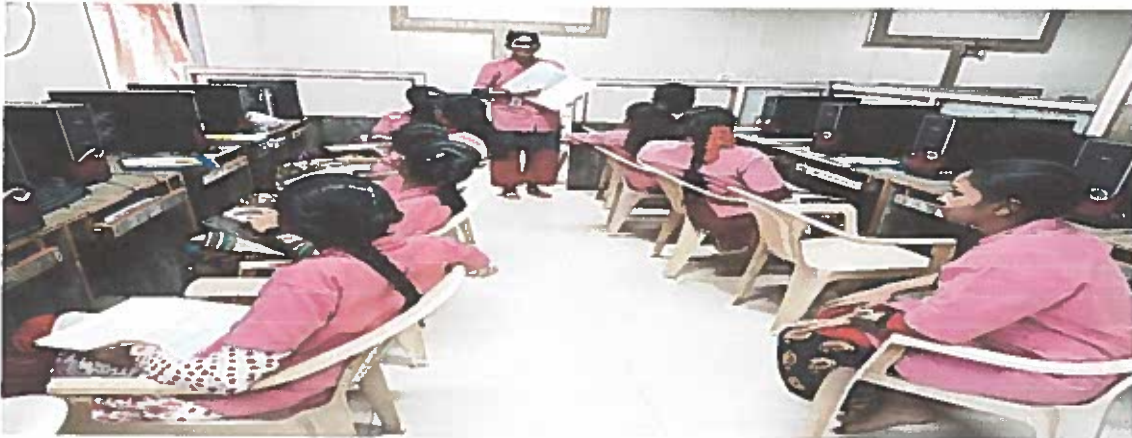
Students Grievance System on 11 August 2018