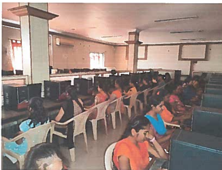
Student Grievance program on 08 July 2020